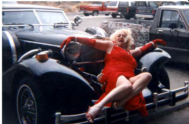
Above all, look like you're having fun