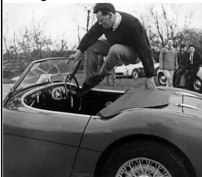
Show the judge some cool moves