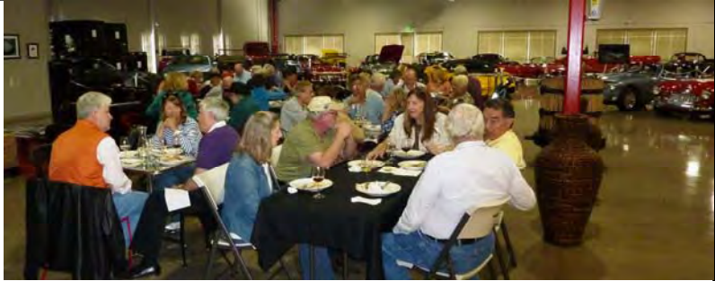
Lunch among the fleet