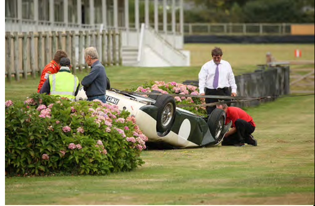
Remember that wet grass can be treacherous