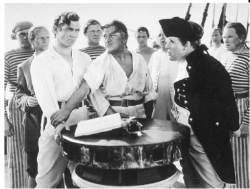
Don't argue with the judge