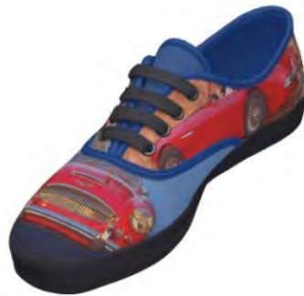
Wear Austin Healey shoes