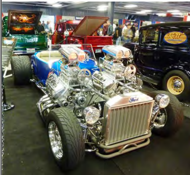
▲ Sometimes one engine just isn't enough. "Double Trouble" has side-by-side blown V8 Ford engines with a total of about 1,000 HP.