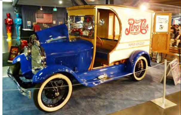
▼ A new application of "chopped top"