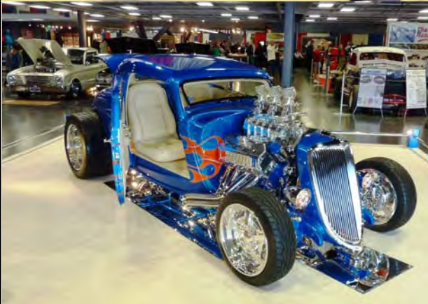
Parking lot special: 1951 Hudson Rambler ►