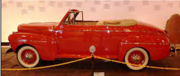
▲ Restored 1941 Ford

Custom cars are works of art and therefore not subject to the rigorous constraints inherent with restorations. Some are monuments to chromium, some have paint jobs that cost more than a new Prius, and some are museum pieces so gorgeous that you would no more consider driving them on the street than you would consider cooking a Faberge egg. For a true motorhead, the creativity and beauty are simply stunning. Enjoy the show!