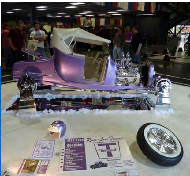
▼ 1923 Ford Roadster hot rod