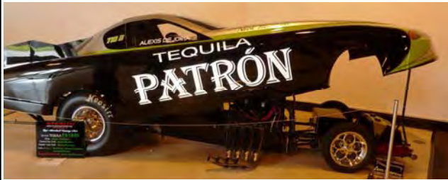
▲ This funny-car does not belong to Jimmy Buffet ▼ Right-hand-drive behemoth Caddy with suicide doors is from Australia