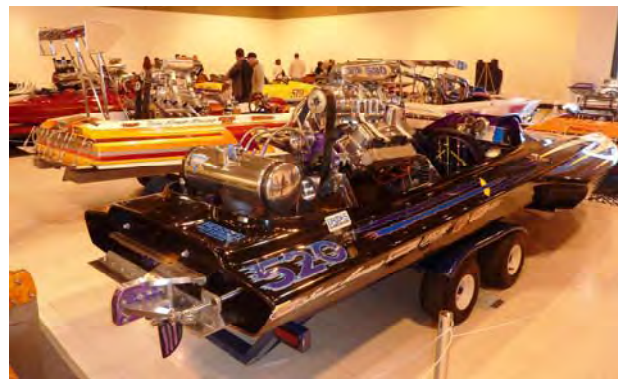
▲ The power boat exhibit