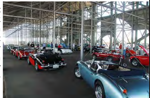
Staging for the gymkhana