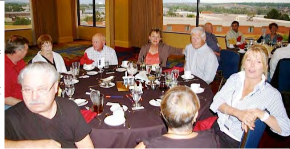
Scenes from the Awards Banquet

straight from the car show for that night's 4 th of July celebration and fireworks. The schedule was somewhat grueling for a hot day, as they weren't allowed to leave the base until 11 pm that night. That made for too a long day, so must of us did not attend.