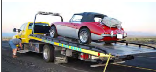
BUNDRGN gets a ride