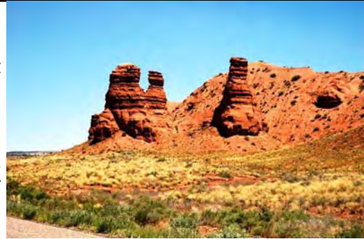
The views ranged from superb...

so I bought a piece of threaded bar 12" long and cut it with a hacksaw. After a delay we finally got started and somewhere in the middle of the day Marty stopped at the side of an offramp and opened the radiator cap. He called that a "stupid guy thing" because all of a sudden we were at the geysers in Yellowstone. Four bottles of drinking water got us to the next town where he bought some antifreeze to replenish the lost fluids.