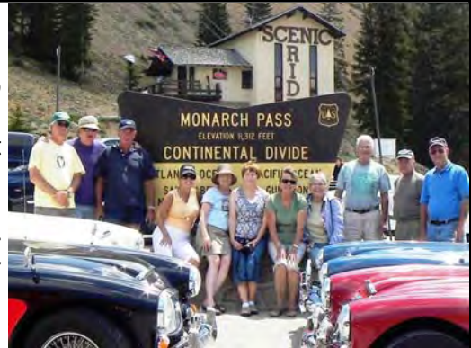
The Group of 7 at Monarch Pass (eastbound)—the Continental Divide.