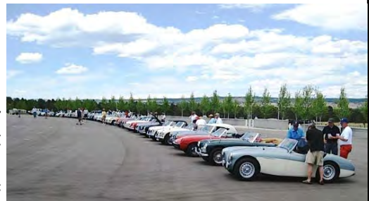
A plethora of Healeys