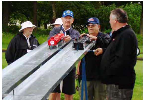
Rocker cover car race