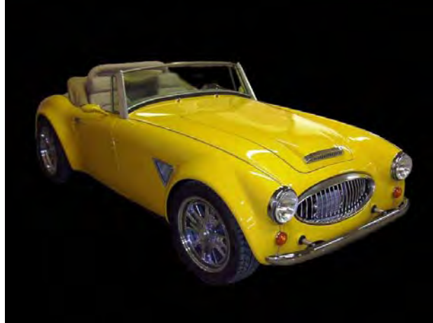
The Sebring MX

The Cobra is by far the most popular replica today, with at least a dozen companies making a kit. Replicas are made of many other cars; a good list with photos can be viewed at www.kitcarlist.com , but only one of the Healey replica manufacturers is listed. Here's the lineup.