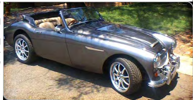
Austin Healey (South Africa)