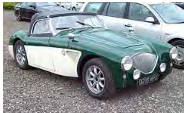
The Haldane 3000