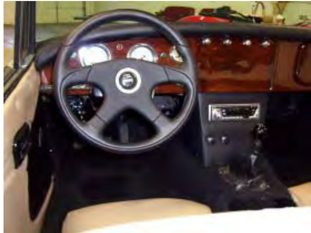
Sebring MX and Saxon interior

Classic Roadsters (Saskatchewan) makes the Sebring MX and the Saxon . The Sebring is designed for high power and speed with flared fenders for wide tires, custom bumpers and side fender vents. The Saxon adheres more closely to the original Austin Healey look. The kits do not include engine or transmission, and turn-key cars are not sold. But not to worry; Great Lakes Roadsters ( www.sebring-mx.com ) near Detroit will put it all together for you. They offer five engines, four transmissions (including automatic), and many options including air conditioning, keyless entry, competition brakes, stereo system, removable hardtop, and more.