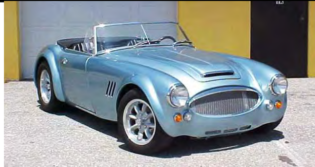
The Cavalier 3000 SS