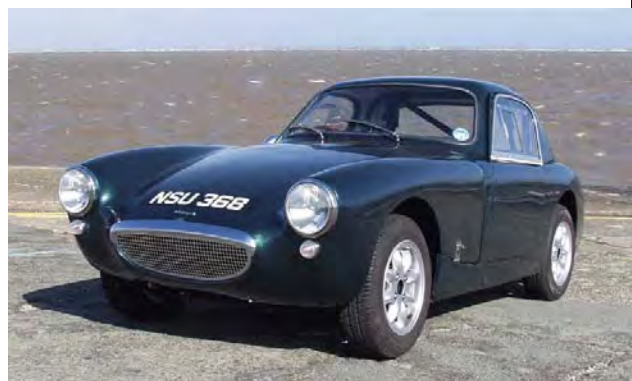
The Sebring Sprite